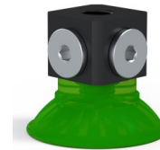
Variant reference: 99B 40PU 18D-3-BD