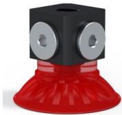
Variant reference: 99A 40PU 18D-3-BD