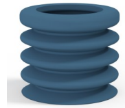
Variant reference: 8K 45SLDB A