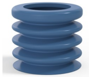
Variant reference: 8K 45SLBLEU A SH30