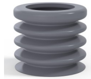
Variant reference: 8K 45SLDG A