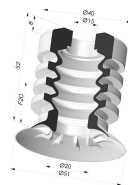
Bellows Suction Cup 4.5 folds Series 95-2, Ø 51 mm