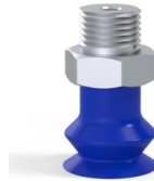
Variant reference: 8SB 15TPUB M18