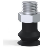
Variant reference: 8SB 15NI M18