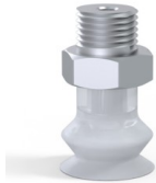
Variant reference: 8SB 15SLT M18