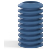
Variant reference: 81A 40SLBLEU A