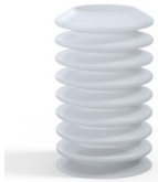
Variant reference: 81A 40SLT A