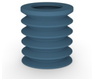
Variant reference: 8K 50SLDB A