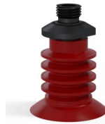
Variant reference: 95 40SL 14D-2