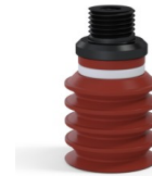
Variant reference: 92 20SLBRIQUE 18D