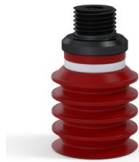
Variant reference: 92 20SL M18D