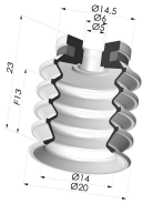
Bellows Suction Cup 4.5 folds Series 92, Ø 20 mm