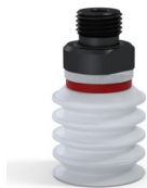
Variant reference: 92 20SLT M18D-5