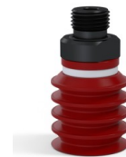
Variant reference: 92 20SL M18D-5