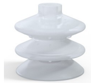
Variant reference: 8 87SLT A