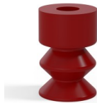
Variant reference: 1 11-2SL A