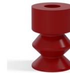
Variant reference: 1 11-2SL A