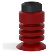
Variant reference: 95-2 30SL 18D-2