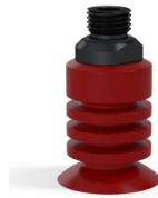
Variant reference: 95-2 30SL 14D-2