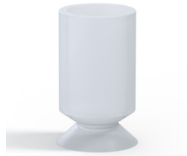
Variant reference: 73 19SLT A