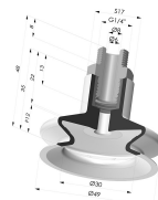
1.5 Bellows Suction Cup Series 8A Ø 49MM