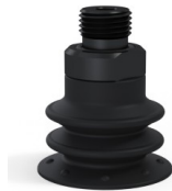
Variant reference: 96 25NI M18D-4-F