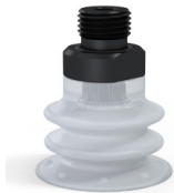
Variant reference: 96 25SLT M18D-4-F