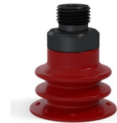
Variant reference: 96 25SL M18D-4-F