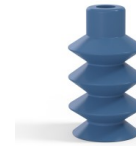
Variant reference: 81 14SLBLEU A SH30