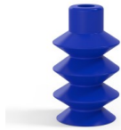
Variant reference: 81 14SLBLEU A