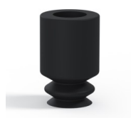
Variant reference: 1 05NI A