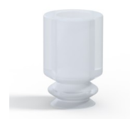
Variant reference: 1 05SLT A