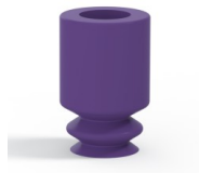
Variant reference: 1 05MNT A