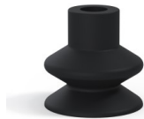
Variant reference: 1 27NI A