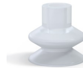
Variant reference: 1 27SLT A