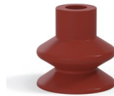
Variant reference: 1 27SL A