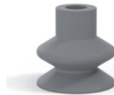
Variant reference: 1 27NR A