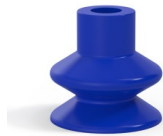
Variant reference: 1 27PU A