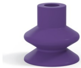
Variant reference: 1 27MNT A