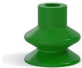
Variant reference: 1 27SLV A