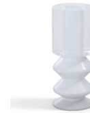
Variant reference: 2 11SLT A