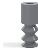
Variant reference: 2 11NR A