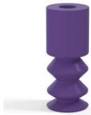
Variant reference: 2 11MNT A