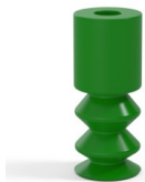
Variant reference: 2 11SLV A