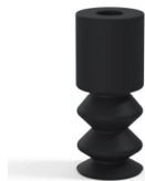
Variant reference: 2 11NI A