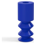
Variant reference: 2 11PU A