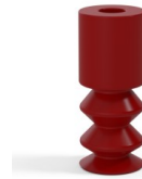
Variant reference: 2 11SL A