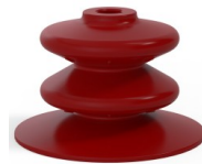
Variant reference: 8 120SL A