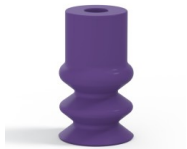
Variant reference: 2 12MNT A