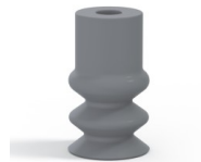
Variant reference: 2 12NR A