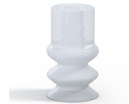
Variant reference: 2 12SLT A