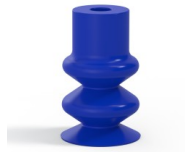
Variant reference: 2 14PU A