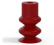
Variant reference: 2 14SL A