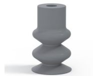
Variant reference: 2 14NR A