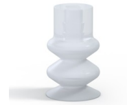
Variant reference: 2 14SLT A