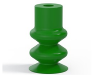
Variant reference: 2 14SLV A