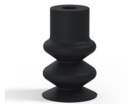
Variant reference: 2 14NI A