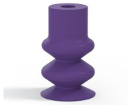
Variant reference: 2 14MNT A