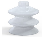
Variant reference: 2 87SLT A