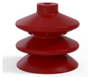
Variant reference: 2 87SL A