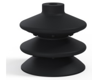
Variant reference: 2 87NI A