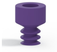
Variant reference: 21 05MNT A