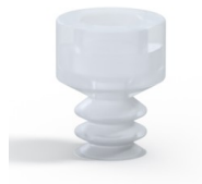
Variant reference: 21 05SLT A