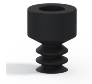
Variant reference: 21 05NI A