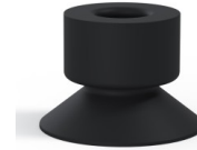
Variant reference: 70A 20NI A