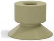
Variant reference: 70A 20CN A