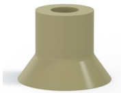
Variant reference: 73 40CN A