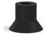
Variant reference: 73 40NI A