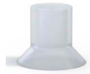
Variant reference: 75 20SLT A