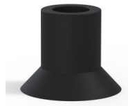
Variant reference: 75 20NI A