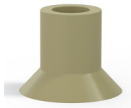
Variant reference: 75 20CN A