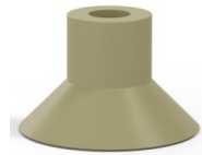
Variant reference: 78 30CN A