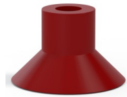
Variant reference: 78 30SL/RV A