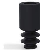
Variant reference: 8 04NI A