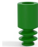
Variant reference: 8 04SLV A