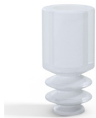
Variant reference: 8 04SLT A