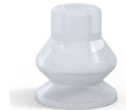
Variant reference: 8 13SLT A