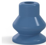
Variant reference: 8 13SLBLEU A SH30