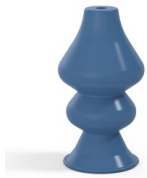
Variant reference: 8 34SLBLEU A SH30