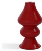
Variant reference: 8 34SL A