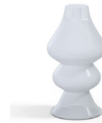
Variant reference: 8 34SLT A