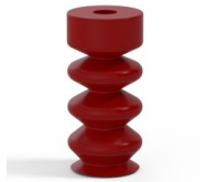
Variant reference: 80A 12SL A