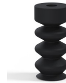
Variant reference: 80A 12NI A