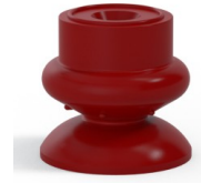
Variant reference: 80A 25SL A SH30