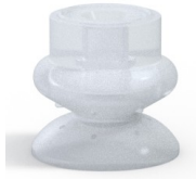
Variant reference: 80A 25SLT A