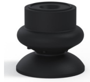
Variant reference: 80A 25NI A