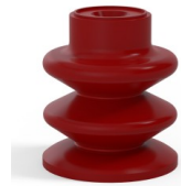
Variant reference: 80A 30SL A