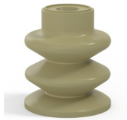
Variant reference: 80A 30CN A