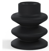
Variant reference: 80A 30NI A