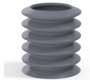
Variant reference: 81 36SLDG A