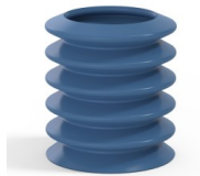
Variant reference: 81 36SLBLEU A SH30