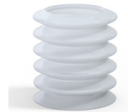
Variant reference: 81 36SLT A SH40