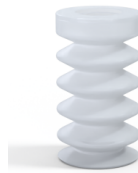
Variant reference: 83 25SLT A SH40