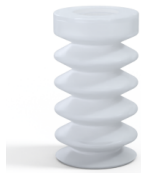
Variant reference: 83 25SLT A