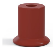
Variant reference: 9 07SL A