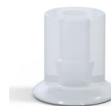
Variant reference: 9 07SLT A