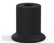
Variant reference: 9 07NI A