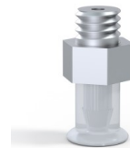
Variant reference: 9 07SLT M5M