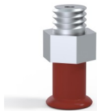
Variant reference: 9 07SL M5M