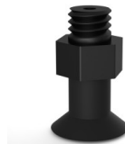
Variant reference: 9 09NI M5M