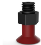
Variant reference: 9 09SL M5M