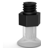
Variant reference: 9 09SLT M5M