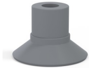
Variant reference: 9 16NR A