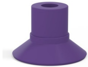
Variant reference: 9 16MNT A