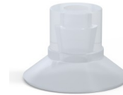
Variant reference: 9 16SLT A