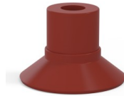
Variant reference: 9 16SL A