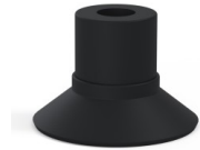
Variant reference: 9 16NI A