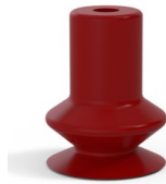
Variant reference: 91 08SL A