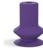
Variant reference: 91 08MNT A