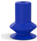
Variant reference: 91 08PU A