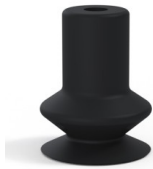
Variant reference: 91 08NI A