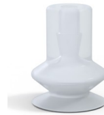
Variant reference: 91 08SLT A