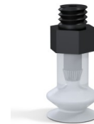
Variant reference: 91 08SLT M5M