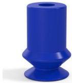
Variant reference: 91 10PU A