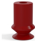
Variant reference: 91 10SL A