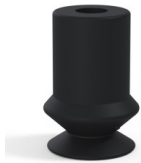
Variant reference: 91 10NI A