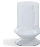
Variant reference: 91 10SLT A