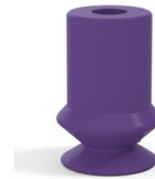
Variant reference: 91 10MNT A