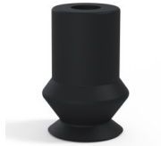
Variant reference: 91 11NI A • Color: Black • Matter: Nitrile