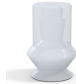
Variant reference: 91 11SLT A • Color: Translucent • CE food certified • Matter: Silicone