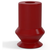
Variant reference: 91 11SL A • Color: Red food-grade CE certification • Matter: Silicone