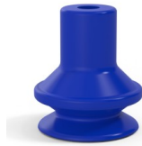
Variant reference: 91 16PU A