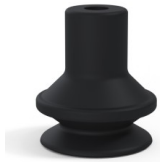
Variant reference: 91 16NI A