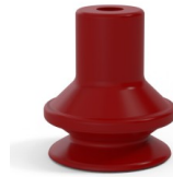
Variant reference: 91 16SL A