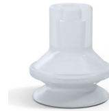
Variant reference: 91 16SLT A