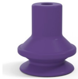
Variant reference: 91 16MNT A