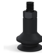
Variant reference: 91 16NI M5M