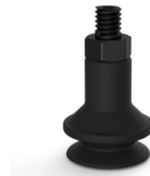
Variant reference: 91 16NI M5M