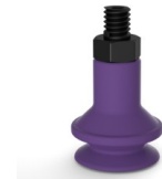
Variant reference: 91 16MNT M5M