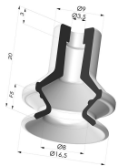
Bellows Suction Cup 1.5 folds Series 91, Ø 16 mm