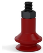
Variant reference: 91 16SL M5M