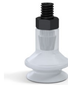
Variant reference: 91 16SLT M5M