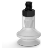
Variant reference: 91 16SLT M5M