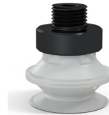
Variant reference: 91 20TPU M18