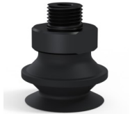
Variant reference: 91 20NI M18