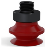
Variant reference: 91 20SL M18