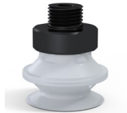
Variant reference: 91 20SLT M18