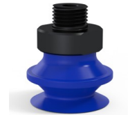
Variant reference: 91 20PU M18