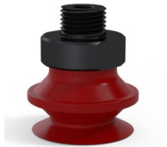
Variant reference: 91 20SL M18