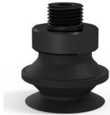
Variant reference: 91 20NI M18