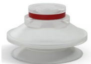
Variant reference: 91 50TPU A