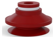
Variant reference: 91 50SL A