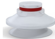
Variant reference: 91 50SLT A