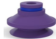
Variant reference: 91 50MNT A