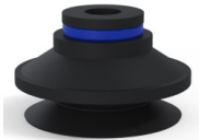
Variant reference: 91 50NI A